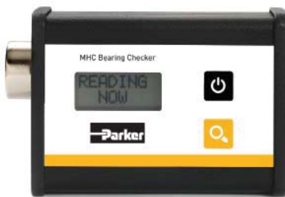
*MHC - Machinery Health Check